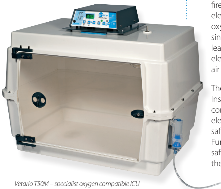
Vetario T50M – specialist oxygen compatible ICU

Elevated oxygen concentration is a vital tool in the successful recovery of animals from a variety of conditions, but when combined with other elements of an intensive care unit (electronics, fans, heaters, etc. which can be a source of ignition) it can pose a very real fire risk if the hazards aren't properly controlled and your intensive care unit hasn't been specifically designed to control this risk.